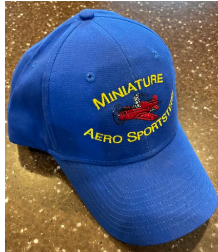
Classic Version $10