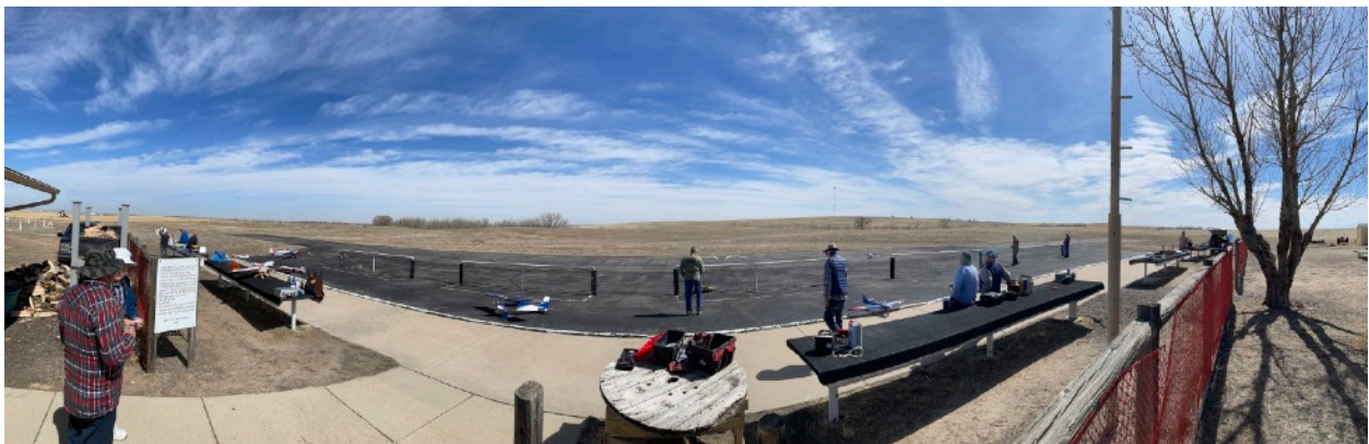
A beautiful Saturday at the field!