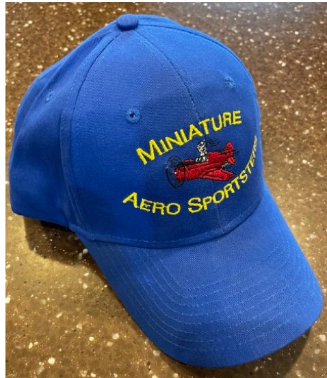
Classic Version $10