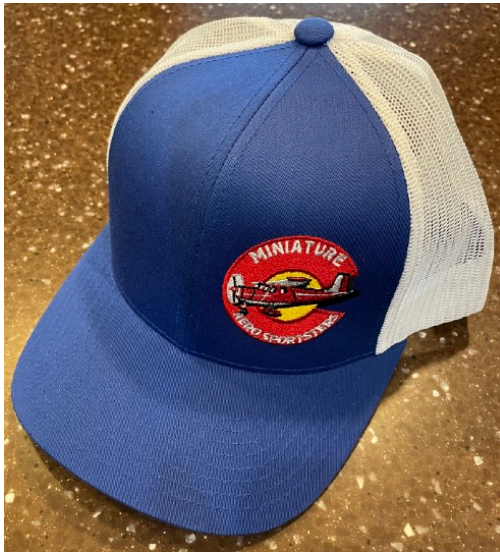
New Logo Version $20