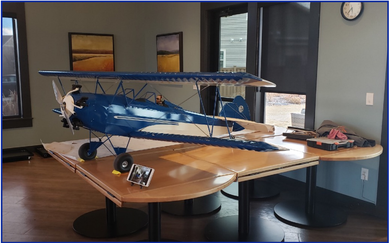
Jack Dunkle sharing his scratch built 1/3 scale 1929 Fleet Biplane!